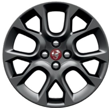
WFJ - 17-Inch Gun Metallic Wheels Standard