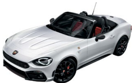
163 - Turini 1975 White (Solid) Standard