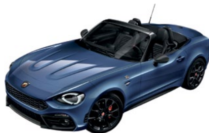
816 - Deep Crystal Blue (Metallic) Option