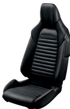
508 - Black Leather with Red Stitching (Option)