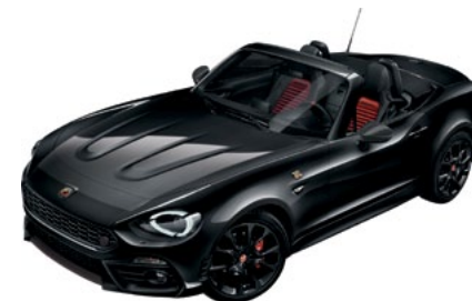
244 - San Marino 1972 Black (Metallic) Option