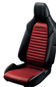
515 - Red/Black Leather with Red Stitching (Option, NAW: 816)