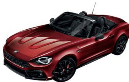
162 - Costa Brava 1972 Red (Solid) Option