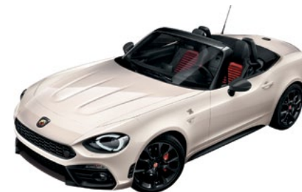
819 - Snowflake White (Tri-Coat) Option