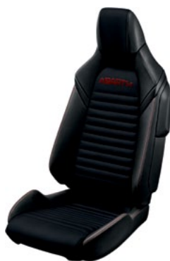
315 - Black Leather & Microfibre with Red Stitching (Standard)