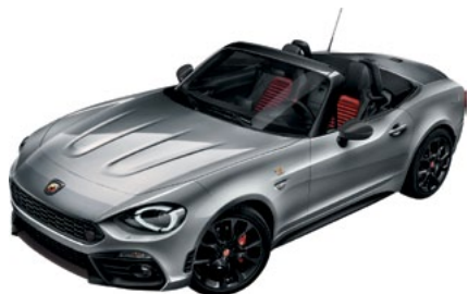
807 - Sonic Silver (Metallic) Option